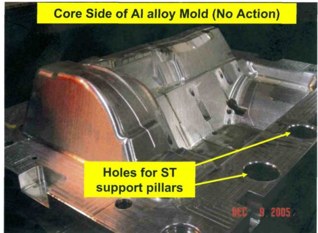
Core Side of Al alloy Mold (No Action)