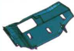
Investment Comparison ZQ Undercover (P20 vs AL Alloy)